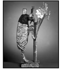
Ram-Caught-in-a-Thicket, ca. 2550 BCE, statuette found in the "Great Death Pit"

Centerpiece of the exhibition is the collection of famous ancient artifacts uncovered and, in some cases, painstakingly conserved, including five objects that art critic and former Metropolitan Museum of Art Director Thomas Hoving called, "the finest, most resplendent and magical works of art in all of America": the Ram-Caught-in-the-Thicket, the Great Lyre with a gold and lapis lazuli bull's head, Queen Puabi's jewelry, an electrum drinking tumbler and a gold ostrich egg as well as the queen's headdress and other treasures large and small.