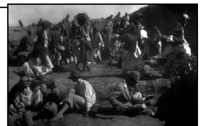
Archaeologist and excavation director C. Leonard Woolley and his wife Katherine Woolley work side-by-side, surrounded by workmen, during the excavation at Ur.

The exhibit will bring details of the famous expedition conducted by Penn Museum and the British Museum to life through field notes, photographs and archival documents and more than 220 ancient artifacts unearthed at the excavation. "Iraq's Ancient Past" looks to the present and future as well, exploring the ongoing story of scientific inquiry and discovery made possible by those excavations as well as the pressing issues around the preservation of Iraq's cultural heritage today.